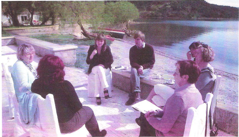
PTPI's Tallinn, Estonia Chapter members travel throughout Europe on the Cultural Treasure Hunt. Here, they enjoy Lesvos Island, Greece.

Members throughout PTPI's European Region enjoyed a productive and rewarding year. In June members from across the globe celebrated the 2011 European Conference. Most recently, the region welcomed new countries to its chapter network: Kosovo and Spain. Highlights follow. For a complete overview of European initiatives, and to get involved as members balance friendship, fun, and furthering the cause of Peace through Understanding , visit www.ptpe.org .